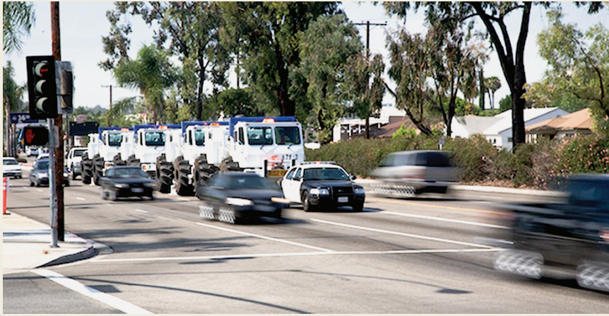
Fig. 3. Vibrator trucks proceed along Cherry Avenue with a police escort.

To reduce the impact of the survey, the hours of operation were restricted for the populated areas. In these areas, the sources could only be activated between the hours of 9 a.m. and 3 p.m. local time, Monday through Friday. It was determined that this schedule would be the least disruptive to the local populace. At other times (e.g., after normal workday hours when there were fewer people present), operations were moved to other areas, such as the airport and the business and warehouse districts.