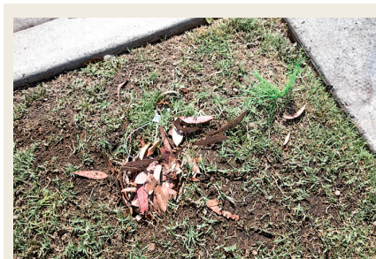
Fig. 1. A buried ARU node is shown, mostly obscured by leaves.